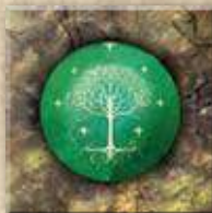
Story Tile Back

Example: A Story tile is revealed which shows a pipe (the symbol for Friendship). The marker on the Friendship Activity Track advances by one space, and the player resolves the space he lands in.