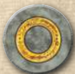
Heart Life Token Sun Life Token Ring Life Token

Each player must now have one of each of the three Life tokens, as evidence that his heart is in the right place (Heart Life token), that darkness is not overtaking him (Sun Life token), and that he is resisting the corrupting influence of the Ring (Ring Life token). For each token missing from his collection, he must move his Hobbit one space to the right on the Corruption Track. Extra Life tokens have no effect, so having two Sun Life tokens does not help a Hobbit any more than a single Sun Life token.